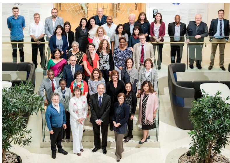
TRUST Funder Workshop participants, Wellcome Trust London