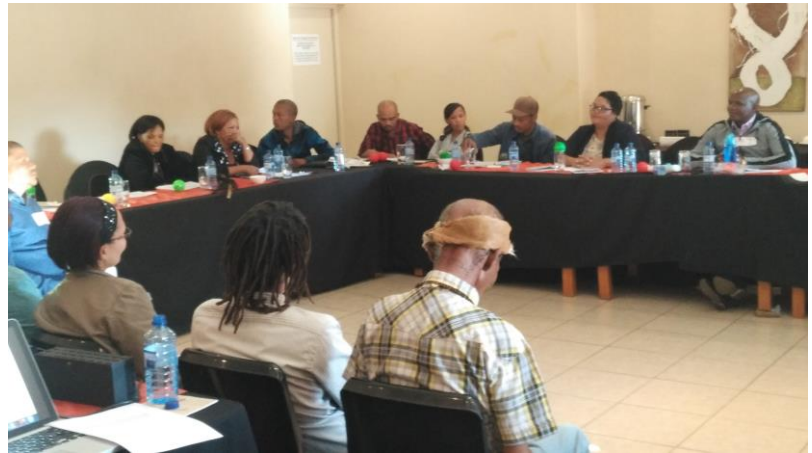
Workshop participants interactively discussing the code in practice.