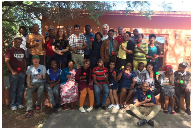
San stakeholders at the workshop 'Consolidating and Disseminating the San Code of Research Ethics' in Upington, South Africa.