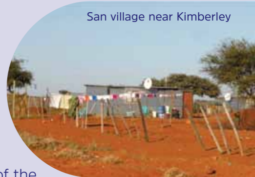
San village near Kimberley

The San are the indigenous population of Southern Africa. Their hunter-gatherer culture stretches back over 20,000 years, and their genetic origins reach back over one million years. After centuries of genocide and marginalization, leading to loss of land, culture and identity, they are still one of the poorest populations in Southern Africa. At the same time, they hold valuable traditional knowledge that is highly interesting for researchers from around the world.