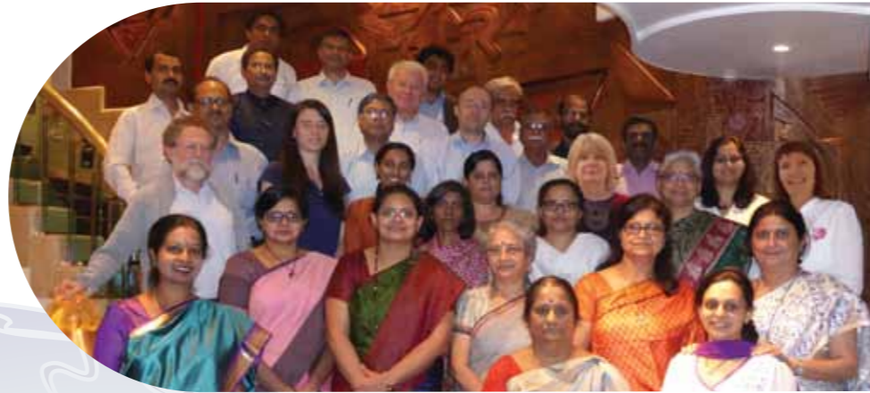
TRUST Workshop in Mumbai, March 2016

TRUST is a 3-year coordination and support action funded by the European Union's Horizon 2020 Programme under grant agreement 664771. 1 October 2015 – 30 September 2018