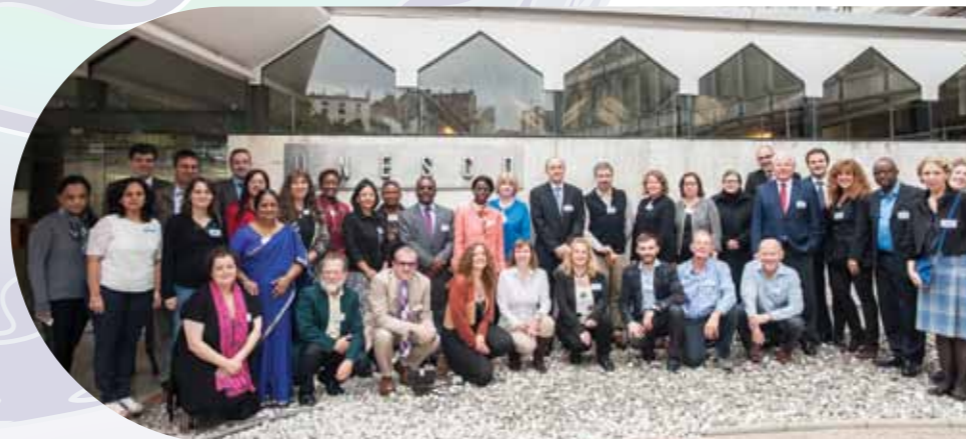
TRUST Kick-off Meeting, UNESCO, Paris October 2015