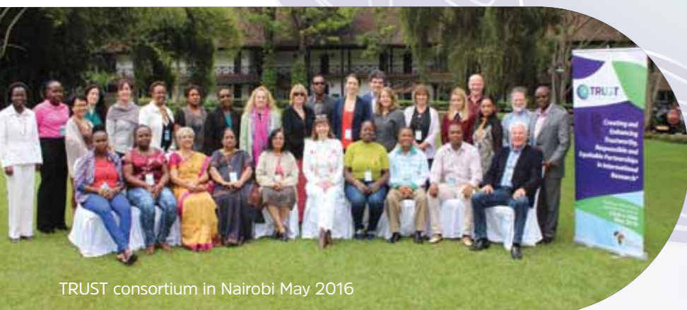
TRUST consortium in Nairobi May 2016